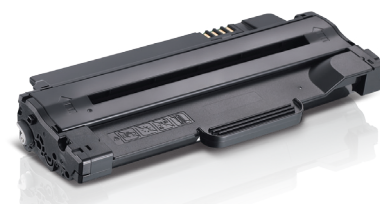
Dell 1130/1130n toner cartridge