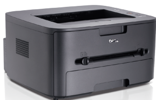
Dell 1130/1130n side view