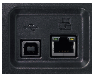
Dell 1130n connectivity