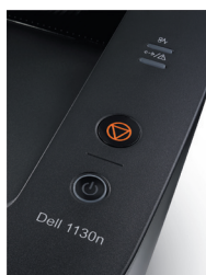
Dell 1130n control panel