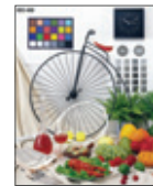
*3 Photo Bike Image

Print Speeds Note: Print speeds may vary depending on print conditions